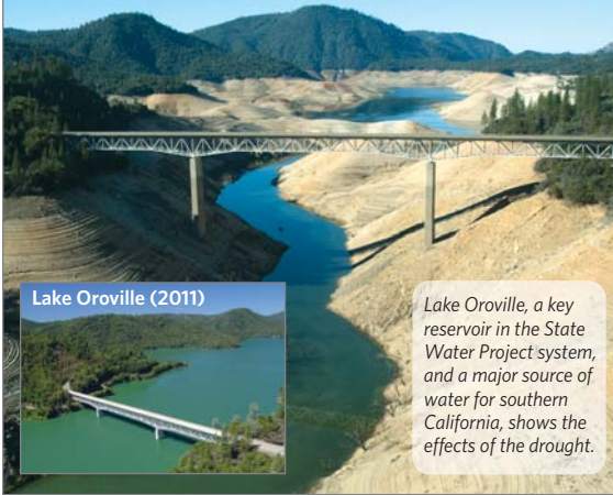
Lake Oroville (2011)

Lake Oroville, a key reservoir in the State Water Project system, and a major source of water for southern California, shows the effects of the drought.